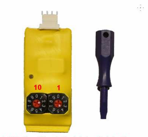
Left switch is the 10's digit, right switch is 1's This module is set to "24" for a correction of 12%

The Yellow Jacket module provides correction factors in ½% increments, which allows you to choose a setting that will adjust your speedometer/odometer to within .25% accuracy. For example, if you determine your speedometer needs a correction factor of 3.2%, setting the dials to 06 will provide a correction of 3%, for an error of only .2%. Setting the dials to 07 would provide 3.5% correction, for an error of .3%. So in this example the setting of 06 gives the best accuracy.