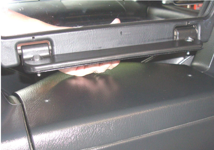
Photo 3 – Place wind screen and base back on glove box lid, feeding screws into holes. Tighten screws.