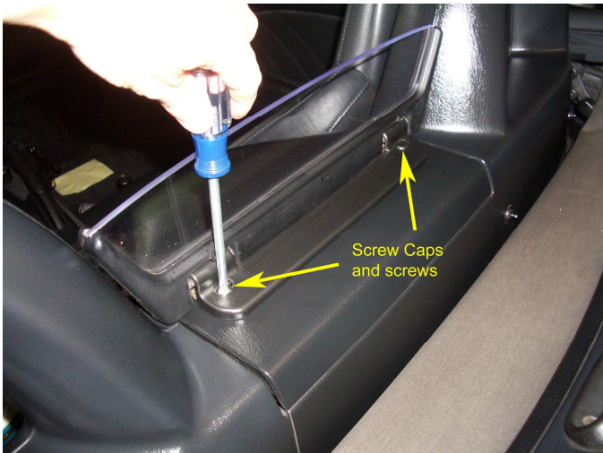
Photo 1 – Remove screw caps and Philips screws, then lift off wind screen.