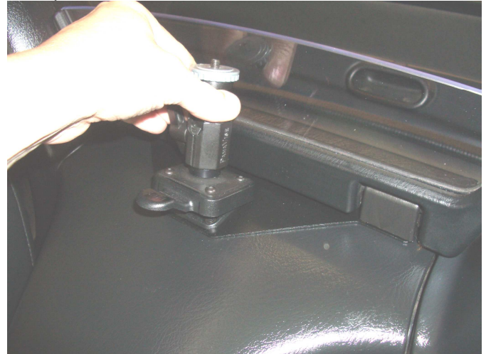
Photo 4 – Tilt pedestal back and catch rear edge under base plate.